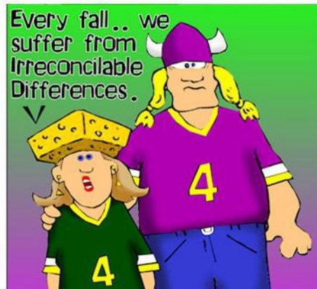
THE UNEQUAL YOKE JOKE || Corinthians 6:14